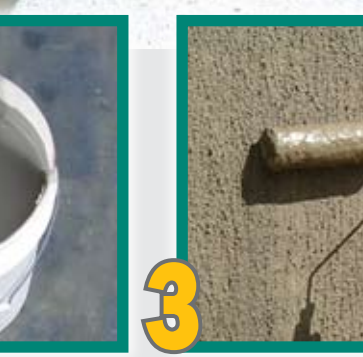
Apply BOND KOTE , ensuring application is uniform in thickness and texture

SAVES TIME & LABOR SUPERIOR BONDING STRENGTH VIRTUALLY ELIMINATES DELAMINATION REDUCES SURFACE PREPARATION COSTS PROVEN PERFORMANCE