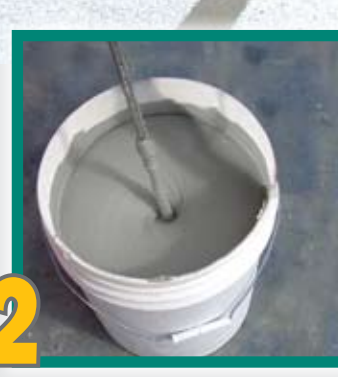
Mix BOND KOTE properly.