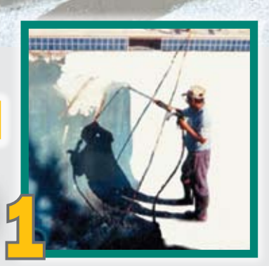
Clean Substrate. Remove loose, delaminated plaster and contaminants.